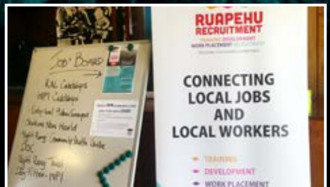
Community Job & Careers Expo

Inspired by the desire to lead and support local enterprise for our people, Ngāti Rangī has launched one of the only iwi-based HR companies of its kind in Ruapehu Recruitment. Continuing to foster and maintain positive and productive internal and external relationships have been key for this mahi which has seen over 50 successful employment outcomes in just the first year for whānau from around the rohe.