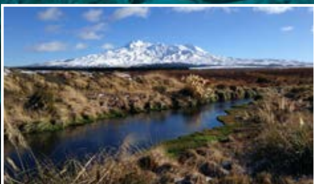
A water intake on the Tomowai Stream

To assist Ngāti Rangī families in working towards owning their own healthy, self-sufficient and sustainable whare, the Ruapehu Whānau Transformation Plan team has implemented a free building Warrant of Fitness programme along with the ongoing development of Te Whare Āhuru Kī Ruapehu sustainable housing solution. Already we're supporting whānau in over 50 homes as we work together towards the improvements and repairs needed to ensure the future wellbeing of all uri.