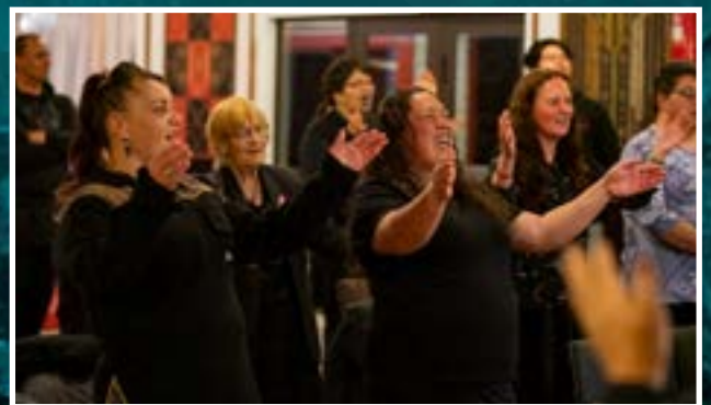
Te Moko Ahurea a Paretaitonga at Maungārongo Marae

As uri, we all need to take the time to celebrate Ngāti Rangī culture and success. Regardless of location, advances in technology have created an ability to reconnect and communicate in ways never dreamt of 20 years ago. Whether exploring tikanga or researching our history and knowledge the ongoing development of digital communication streams is globally uniting us through the likes of e-pānui, images and video.