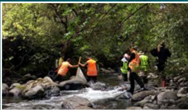
Water monitoring on the Mangawhero River

Our environment is the fundamental starting point for all Ngāti Rangī initiatives. To ensure the effective management of the rohe and abundant resources, our Taiao team are heavily involved in a large number of Cultural Monitoring projects. From the top of Koro Ruapehu traversing down through the dense native bush to the lower reaches of the Whangaehu, the sustainable management of our land is at the heart of our mahi.